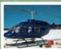
BELL 206 LR